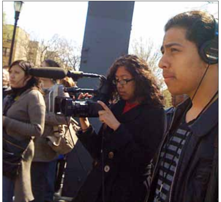
GAP YOUTH AT A RALLY

Rewriting the story starts with an understanding of the forces that shaped it in the first place. Our curriculum fosters this understanding by helping young people identify the root causes of the challenges their communities face.